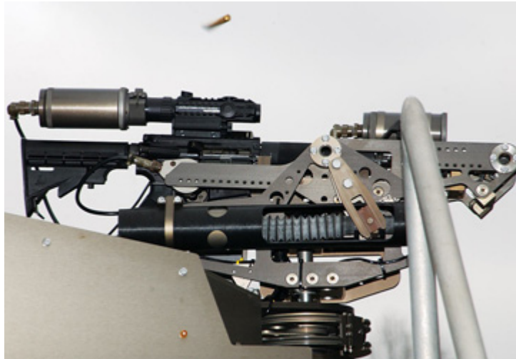
Photo 3 on the right shows the ROWS (Remote Operational Weapons System) hardware at Oak Ridge. This is a heat-seeking mechanized rifle system that automatically locks onto anything in its sensor range. It fires upon the command of guard underground:

photo below of Oak Ridge facility: