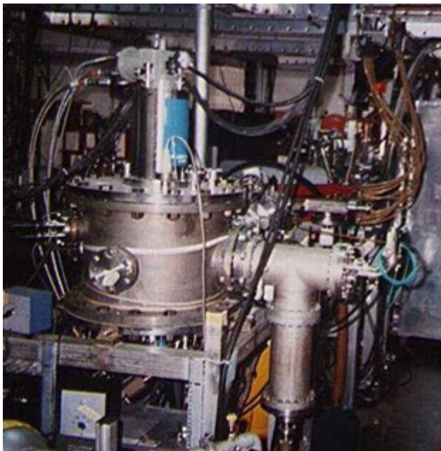
Photo 4 on the left shows one of the separator pumps at the Dulce genetics facility. Taken from Level 5, this is for working with blood plasma: